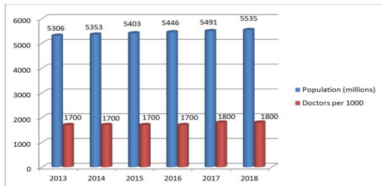
Fig. 1. Doctors (per 1,000 populations) as compared with the total world population (millions) (adapted from [2])

Outpatient clinic is a facility where patients come to have a consultation and receive treatment. It can be a part of the hospital or a private clinic. In this paper two disciplines of healthcare are considered from operations research and operations management perspectives.